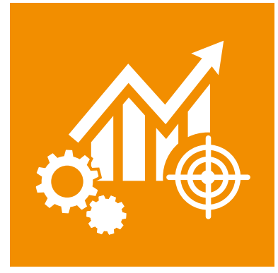
Thesis 2: VAT compliance results in effectiveness and resource efficiency