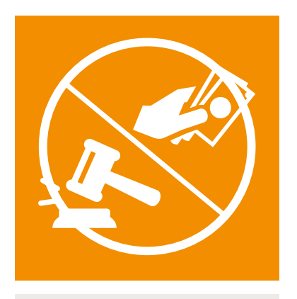
Thesis 4: VAT compliance avoids the risk of costly penalties