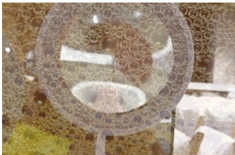
Jiajia Zhang, Beautiful Mistakes (after LB), 2022, Videostill, HD Video, 08:58, 16:9, Color, Sound, Courtesy the artist