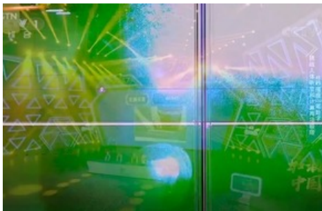
Jiajia Zhang, Between the Acts, 2022, video still, HD video, 38'33", 16:9, color, sound, Courtesy the artist