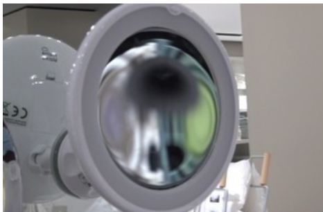
Jiajia Zhang, Beautiful Mistakes (after LB), 2022, Videostill, HD Video, 08:58, 16:9, Color, Sound