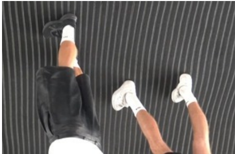
Jiajia Zhang, Beautiful Mistakes (after LB), 2022, Videostill, HD Video, 08:58, 16:9, Color, Sound, Courtesy the artist