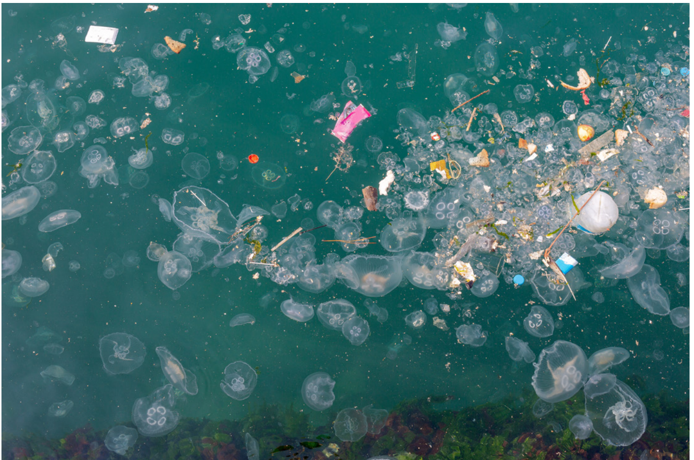
Above: Jellyfish at surface of ocean surrounded by floating marine plastics.

The Zero Draft of a new Global Plastics Treaty provided in advance to INC-3 provides a firm basis for discussion on remediation and should be retained and strengthened. Here, we summarise a number of recommendations for policy-makers when assessing these elements to ensure remediation is conducted in the context of restoration and social well-being, is environmentally sound and is responsive to the special circumstances of SIDS, LDCs and other developing countries.